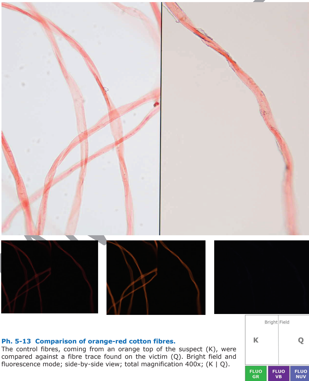
Ph. 5-13 Comparison of orange-red cotton fibres.

Red-orange cotton fibres were found as possible target fibres on the body of a murdered woman. At the residence of a suspect, an orange T-shirt was seized. A comparison of this cotton type was performed in a side-by-side view. The comparison in [Ph. 5-13] mainly illustrates the corresponding fibre colour in bright field mode and the corresponding fluorescence with the three fluorescence cubes.